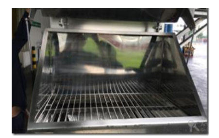
Inside Bag dumping station