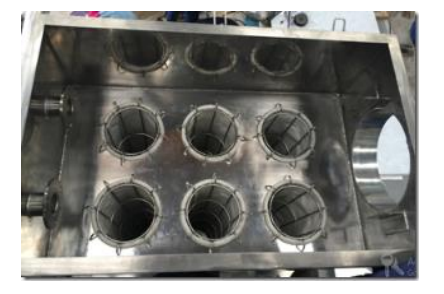
Inside Bag filter housing